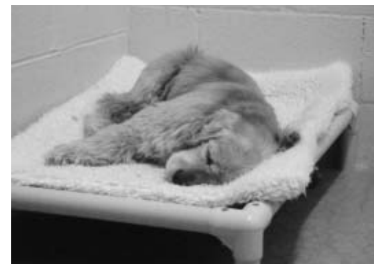
Buffy sound asleep on a Kuranda Cot with Fleece Blanket

You are welcome to bring items from home to make your pet's stay more enjoyable. Owners may bring a machine washable blanket from home between November 1st and April 30th. Foam, cedar filled, & bean bag type beds from home are not permitted as they are difficult or impossible to wash. For sanitation and parasite control, no fabric items may be left in the kennel during the summer/fall flea season from May 1st thru October 31st. We offer clean fleece blankets for owners who desire added comfort for their pets. Our fleece blankets have a 600 thread count and are a double layer of quilted artificial lambs wool. All dogs are provided with a cot as part of the basic boarding service.