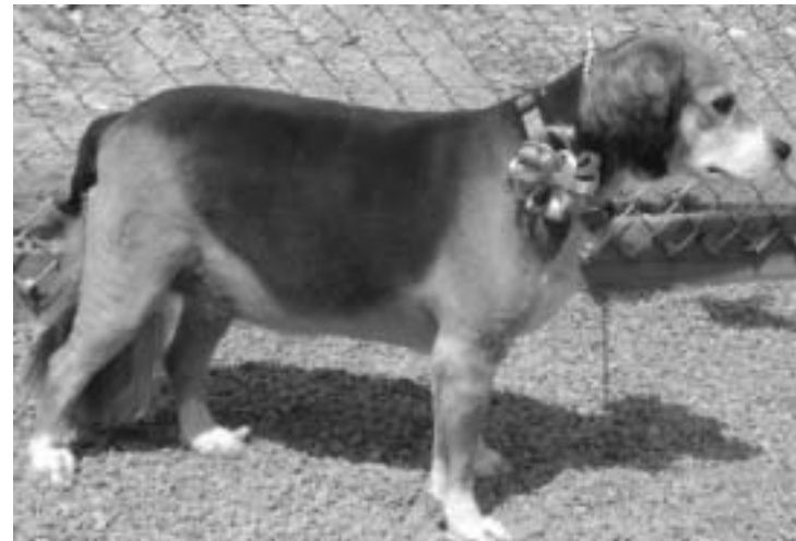
"Baby" a beagle mix was the February winner of our monthly drawing for a FREE Deluxe Full Groom

family. Our goal at Trillium Pet Care's Lifestyle Classes is to help you have a better behaved dog. Inquire today. Trillium Pet Care boarding and grooming clients will receive a discount.